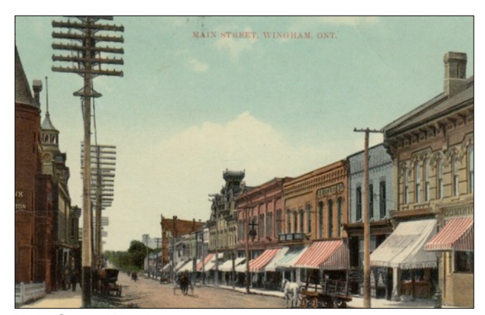
Main Street Wingham

Telephone 519-524-1156 or email davidarmstrong@hurontel.on.ca