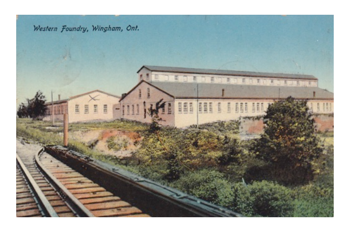
Wingham Foundry Postcard