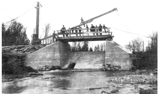
The four Benmiller pictures above are from a sheaf of photos in longtime resident Dorothy Fisher's collection of Benmiller memorabilia compiled by Mac Campbell.